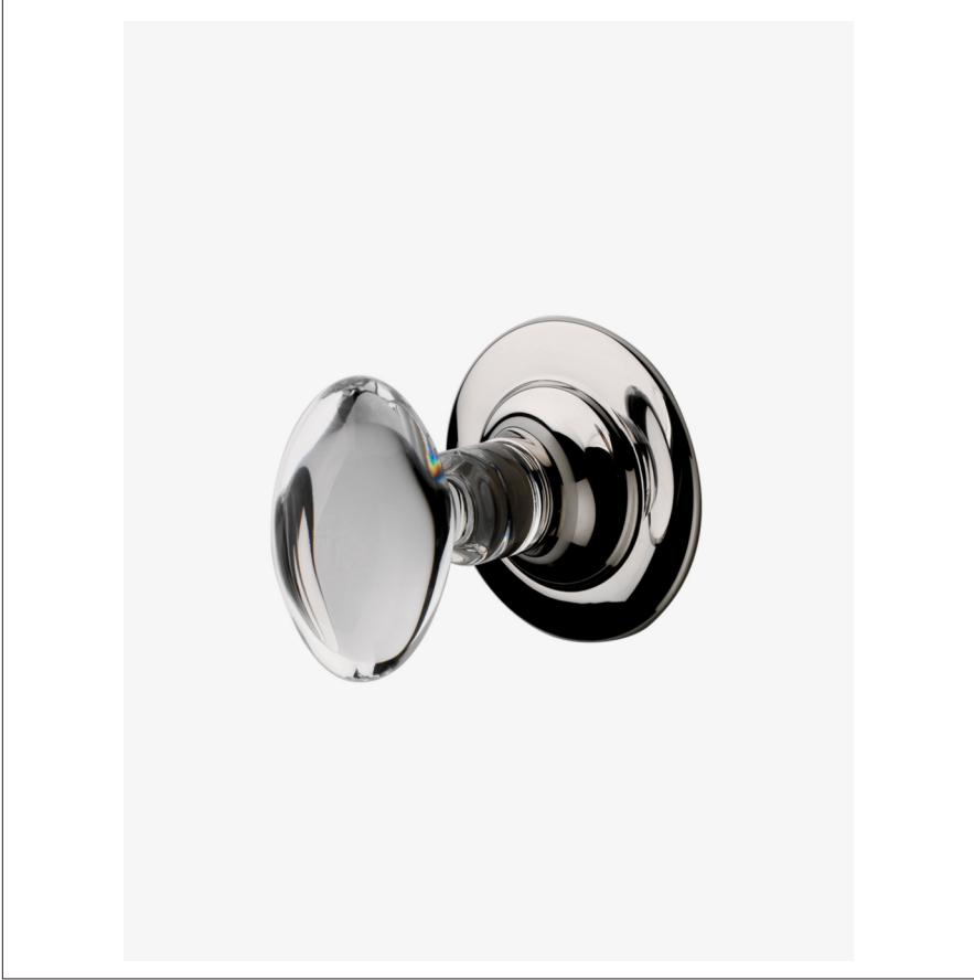
SHOWN IN OPUS VOLUME CONTROL VALVE TRIM WITH CRYSTAL EGG HANDLE | OPVC38