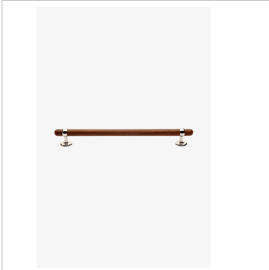
SHOWN IN STOCKTON 12" WALNUT PULL | SKHW12