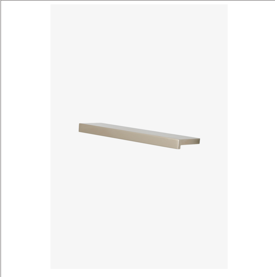
SHOWN IN APEX 6" PULL | AXHW06