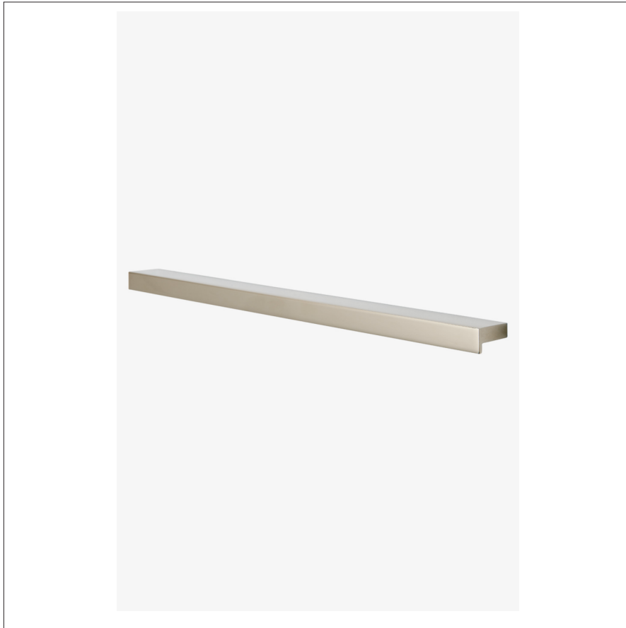
SHOWN IN APEX 12" PULL | AXHW12