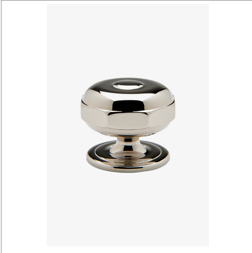
SHOWN IN CAMDEN 1 1/2" KNOB| CAHW02