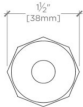
FRONT VIEW SCALE: 6"=1'-0"