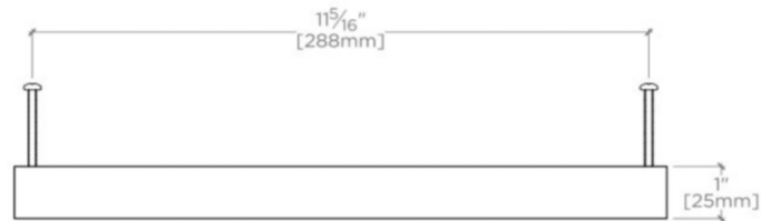
TOP VIEW SCALE: 3"=1'-0"