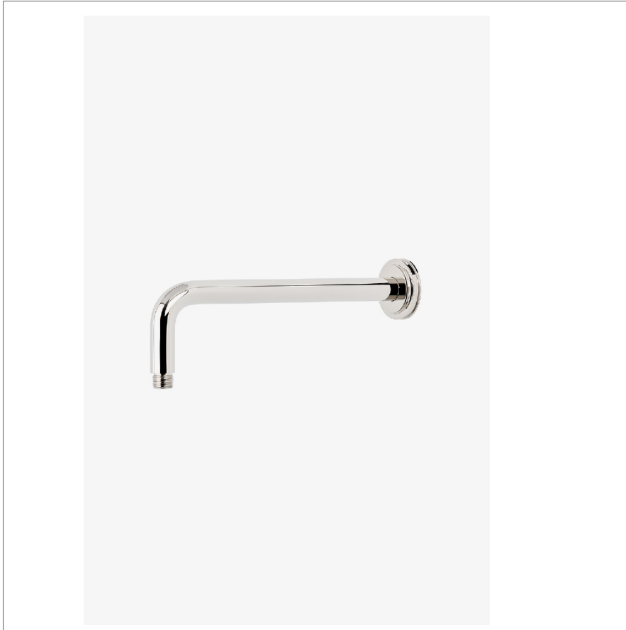
SHOWN IN UNIVERSAL CLASSIC 12" WALL MOUNTED 90 DEGREE SHOWER ARM WITH LOW PROFILE FLANGE | UCWL12

Universal Classic 12" Wall Mounted 90 Degree Shower Arm with Low Profile Flange