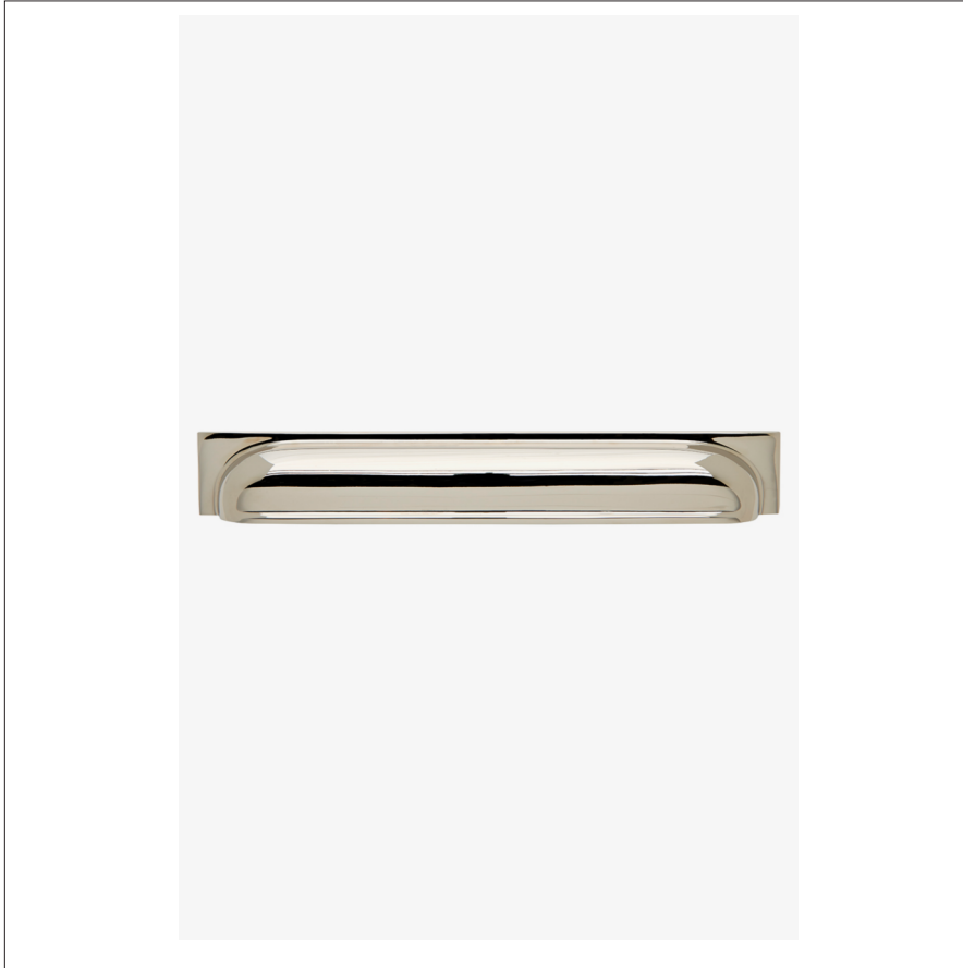
SHOWN IN PARAGON 9" PULL | PGHW09