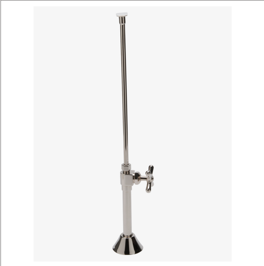
SHOWN IN UNIVERSAL STRAIGHT WATERCLOSET SUPPLY KITS 1/2" SWEAT X 3/8" O.D. COMPRESSION| UNMS39

Universal Straight Watercloset Supply Kits 1/2" Sweat x 3/8" O.D. Compression