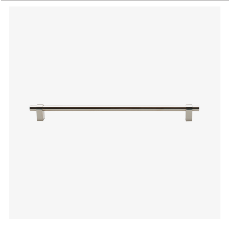
SHOWN IN PINNACLE 10" PULL | PAHW10