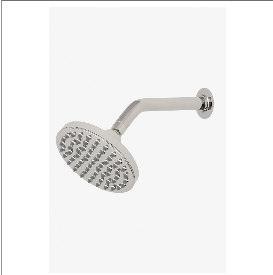
SHOWN IN BOND 6" SHOWERHEAD WITH 8" WALL MOUNTED 45 DEGREE SHOWER ARM | BNS265

Bond 6" Showerhead with 8" Wall Mounted 45 Degree Shower Arm