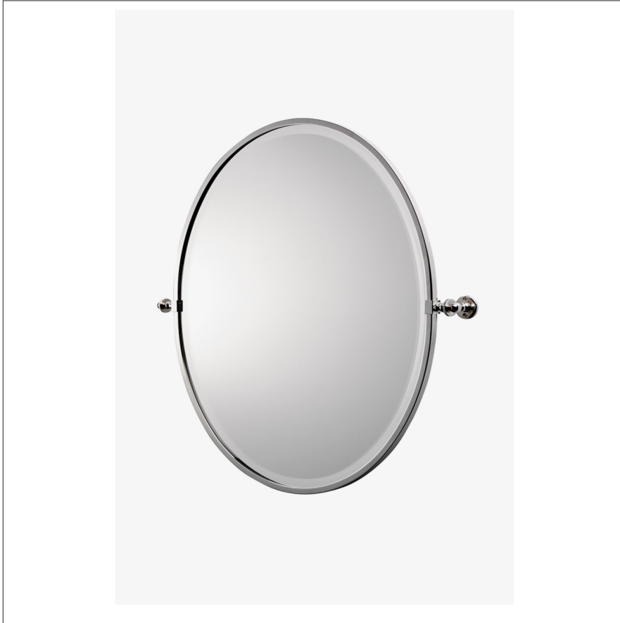
SHOWN IN CRYSTAL METAL OVAL WALL MOUNTED TILTING MIRROR 25 7/16" X 29 15/16" X 2 3/4" | CRMR43

Crystal Metal Oval Wall Mounted Tilting Mirror 25 7/16" x 29 15/16" x 2 3/4"