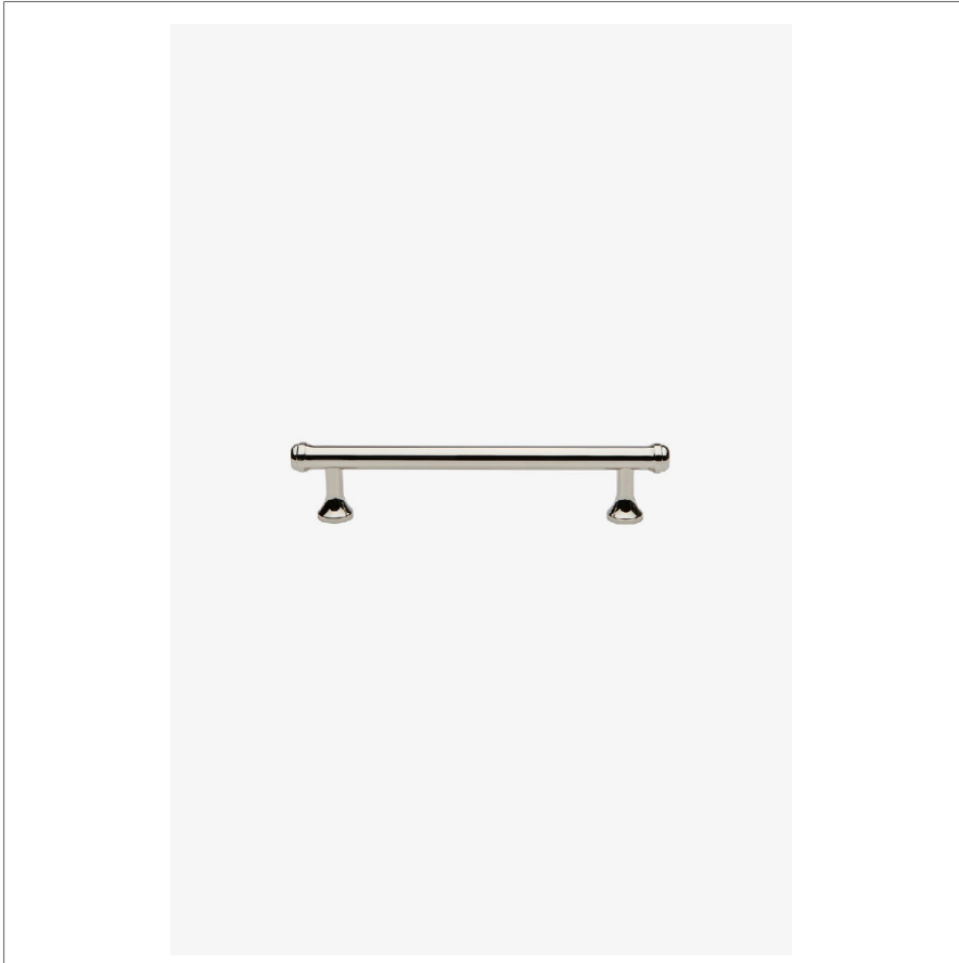
SHOWN IN EASTON 6" PULL | EAHW06