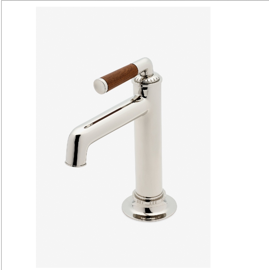
SHOWN IN HENRY CHRONOS ONE HOLE LAVATORY FAUCET WITH WALNUT LEVER HANDLE | CLS414

Henry Chronos One Hole Lavatory Faucet with Walnut Lever Handle