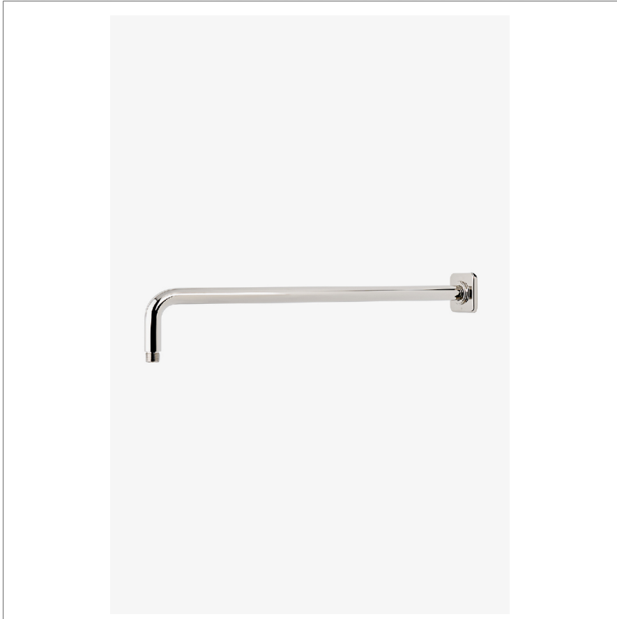
SHOWN IN LUDLOW 22" WALL MOUNTED 90 DEGREE SHOWER ARM WITH FLANGE | LDWL22

Ludlow 22" Wall Mounted 90 Degree Shower Arm with Flange