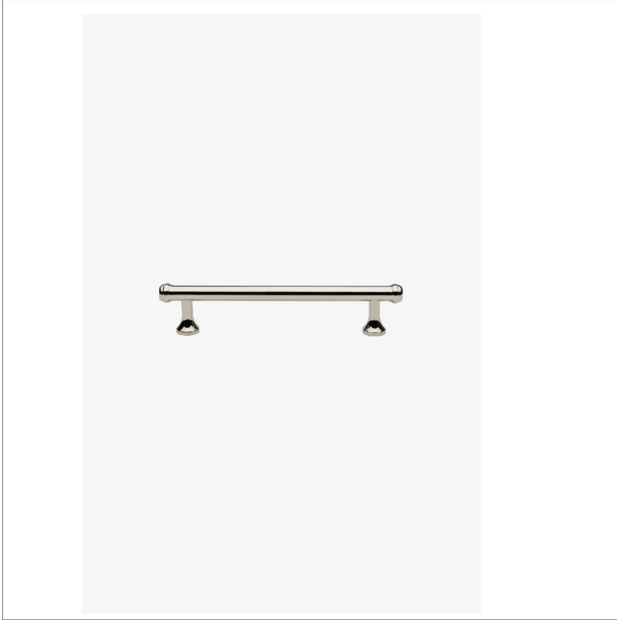
SHOWN IN EASTON 6" PULL | EAHW06