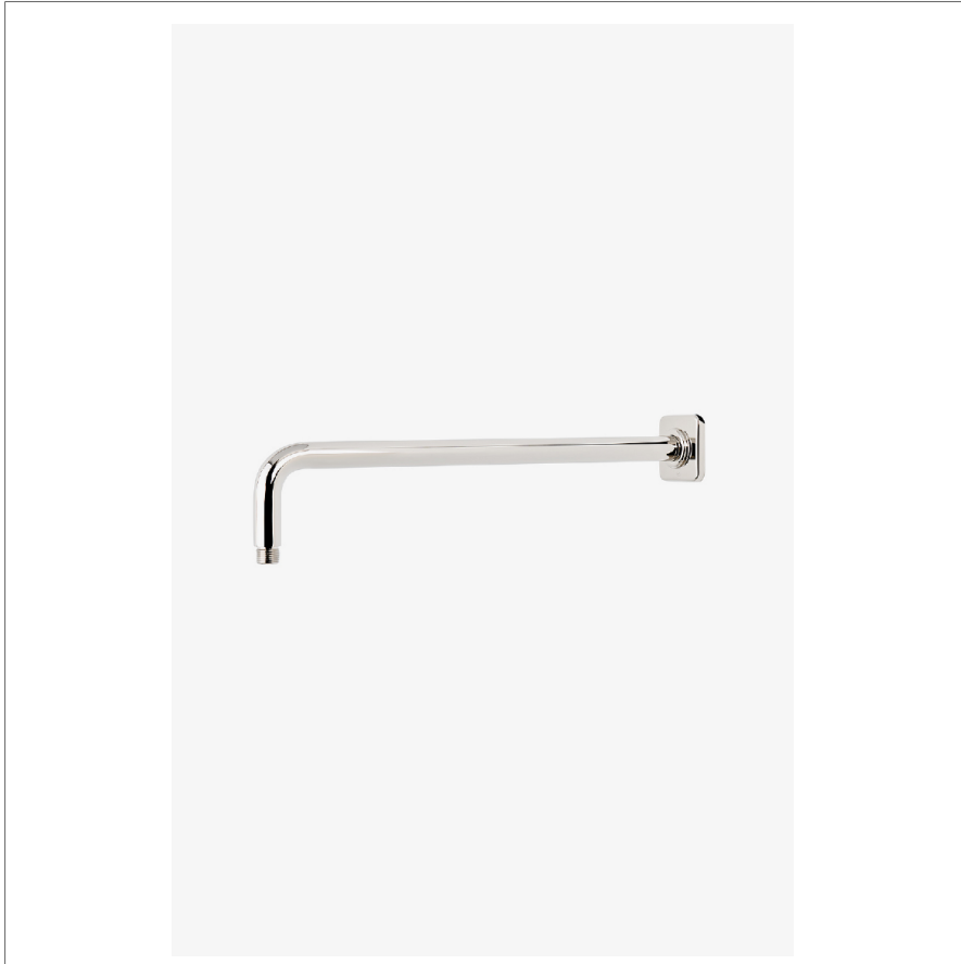
SHOWN IN LUDLOW 18" WALL MOUNTED 90 DEGREE SHOWER ARM WITH FLANGE | LDWL18

Ludlow 18" Wall Mounted 90 Degree Shower Arm with Flange