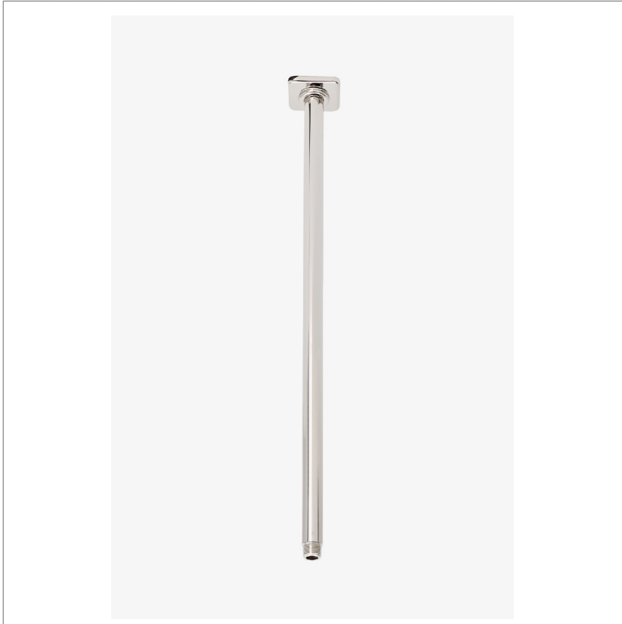
SHOWN IN LUDLOW 24" CEILING MOUNTED SHOWER ARM WITH FLANGE | LDCL24

Ludlow 24" Ceiling Mounted Shower Arm with Flange