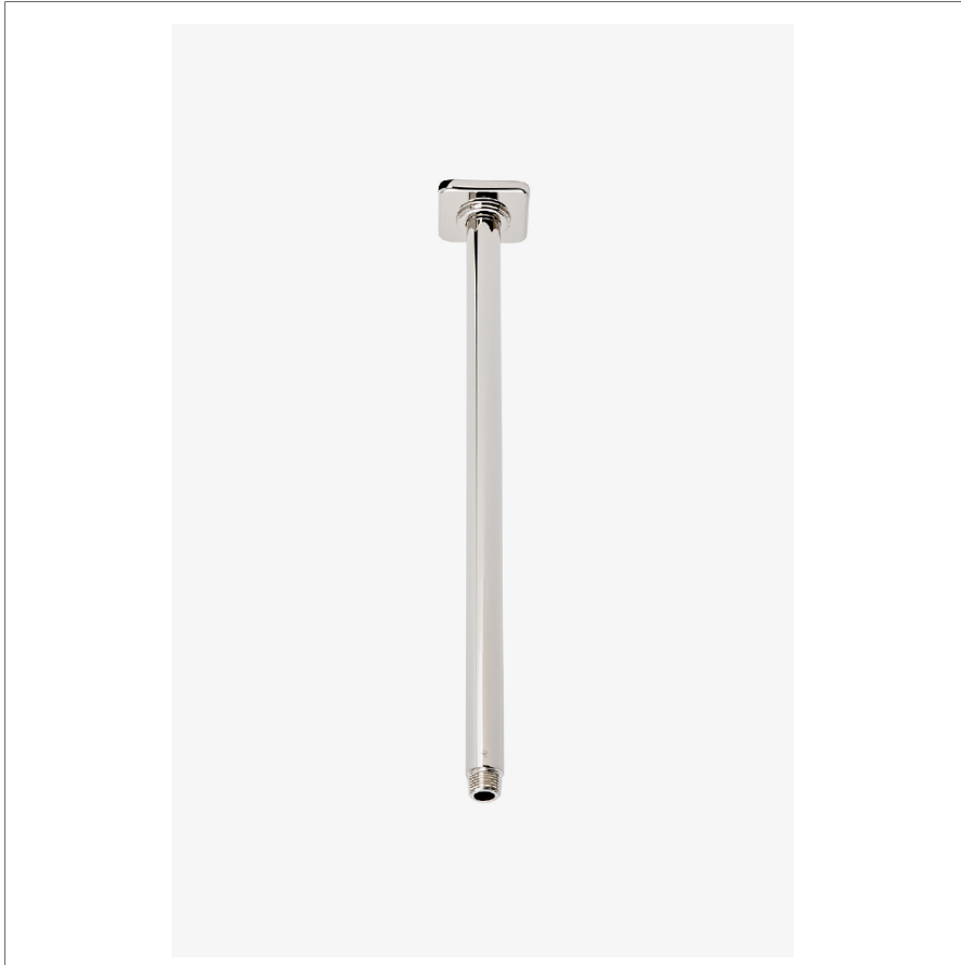
SHOWN IN LUDLOW 18" CEILING MOUNTED SHOWER ARM WITH FLANGE | LDCL18

Ludlow 18" Ceiling Mounted Shower Arm with Flange