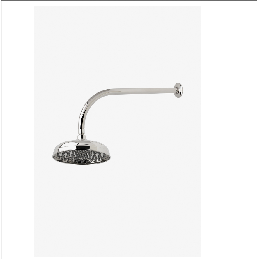
SHOWN IN OPUS 8" RAIN SHOWERHEAD WITH 18" WALL MOUNTED 90 DEGREE SHOWER ARM | OPS188

Opus 8" Rain Showerhead with 18" Wall Mounted 90 Degree Shower Arm