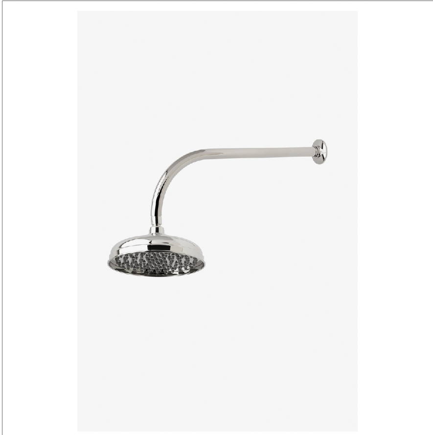
SHOWN IN OPUS 8" RAIN SHOWERHEAD WITH 18" WALL MOUNTED 90 DEGREE SHOWER ARM | OPS188

Opus 8" Rain Showerhead with 18" Wall Mounted 90 Degree Shower Arm