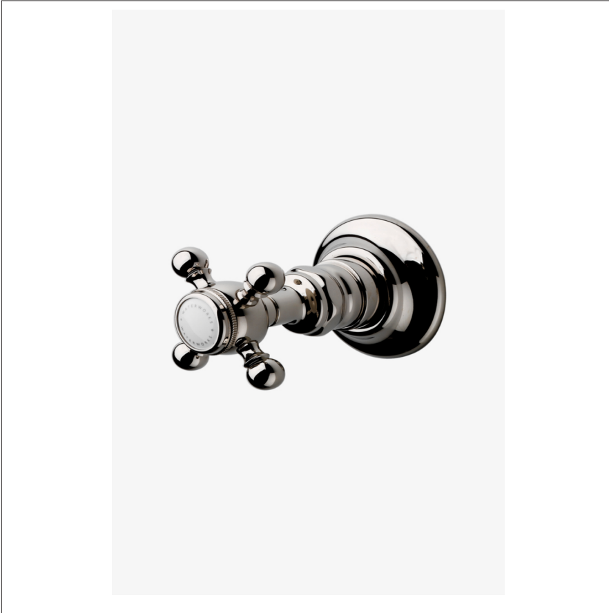
SHOWN IN JULIA VOLUME CONTROL VALVE TRIM WITH METAL CROSS HANDLE| JUVC34