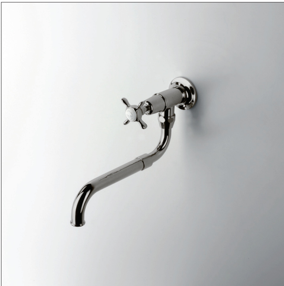
SHOWN IN Nickel

Available option that complies with 0.25% Weighted Average Lead Content (WALC).