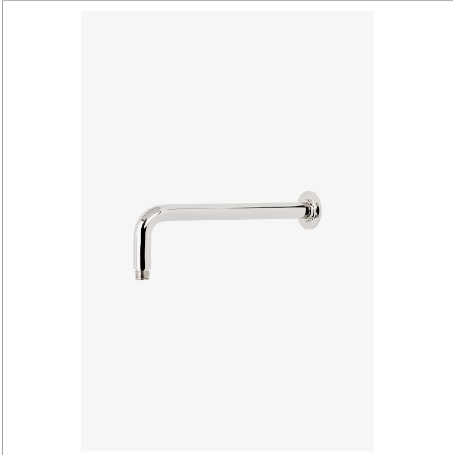
SHOWN IN BOND 12" WALL MOUNTED 90 DEGREE SHOWER ARM WITH FLANGE | BNWL12

Bond 12" Wall Mounted 90 Degree Shower Arm with Flange