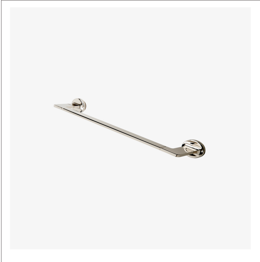
SHOWN IN FORMWORK 18" SINGLE METAL TOWEL BAR| FMTB18