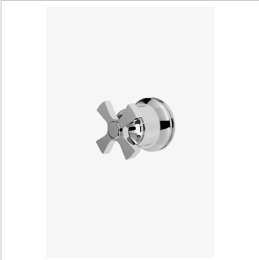
SHOWN IN TRANSIT VOLUME CONTROL WITH CROSS HANDLE | TRVC40

Transit Volume Control with Cross Handle