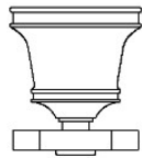
TOP VIEW SCALE: 3"=1'-0"

Transit Volume Control with Cross Handle