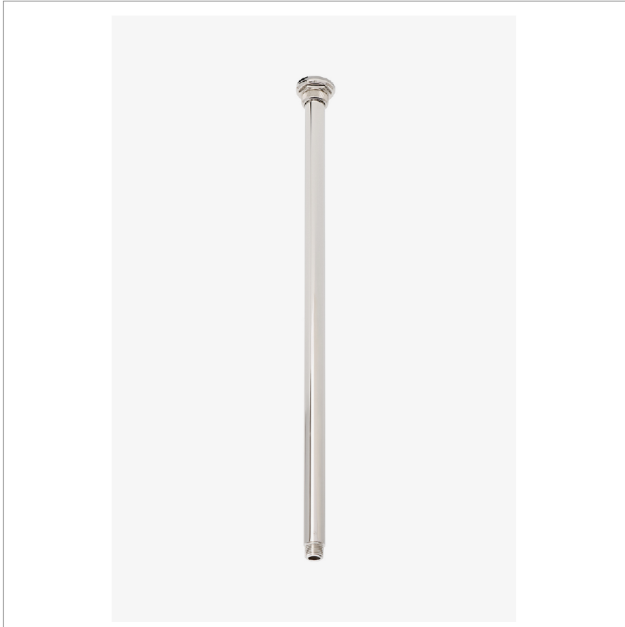
SHOWN IN R.W. ATLAS 24" CEILING MOUNTED SHOWER ARM WITH FLANGE | RWCL24

R.W. Atlas 24" Ceiling Mounted Shower Arm with Flange