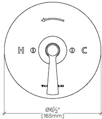
FRONT VIEW SCALE: 3"=1'-0"