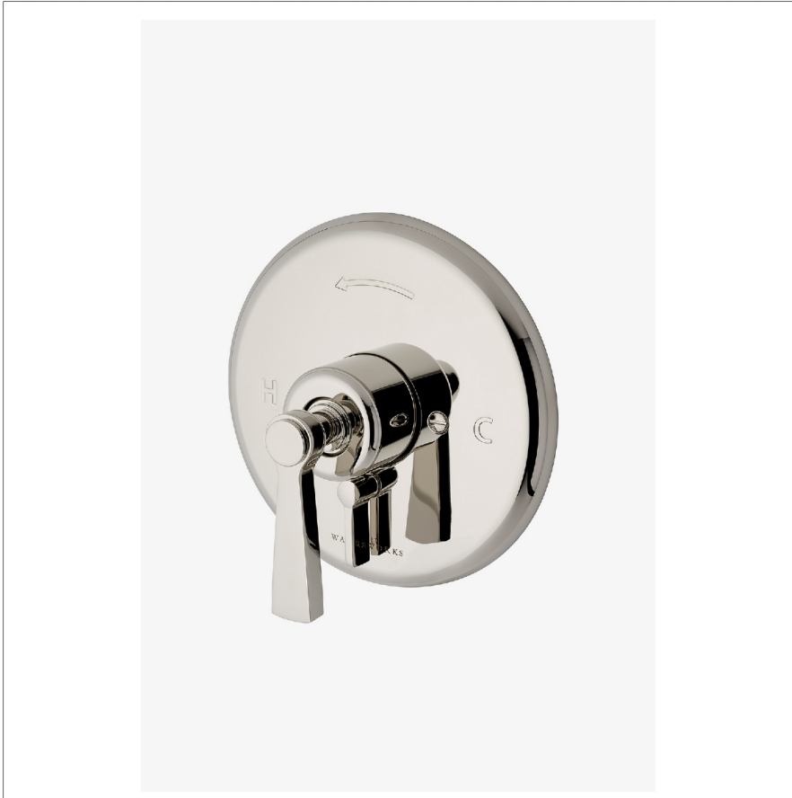
SHOWN IN TRANSIT PRESSURE BALANCE WITH DIVERTER TRIM WITH LEVER HANDLE | TRPB30

Transit Pressure Balance with Diverter Trim with Lever Handle