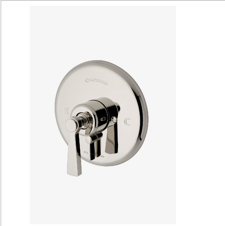
SHOWN IN TRANSIT PRESSURE BALANCE WITH DIVERTER TRIM WITH LEVER HANDLE | TRPB30

Transit Pressure Balance with Diverter Trim with Lever Handle