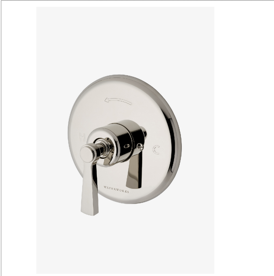
SHOWN IN TRANSIT PRESSURE BALANCE CONTROL VALVE TRIM WITH LEVER HANDLE | TRPB10

Transit Pressure Balance Control Valve Trim with Lever Handle