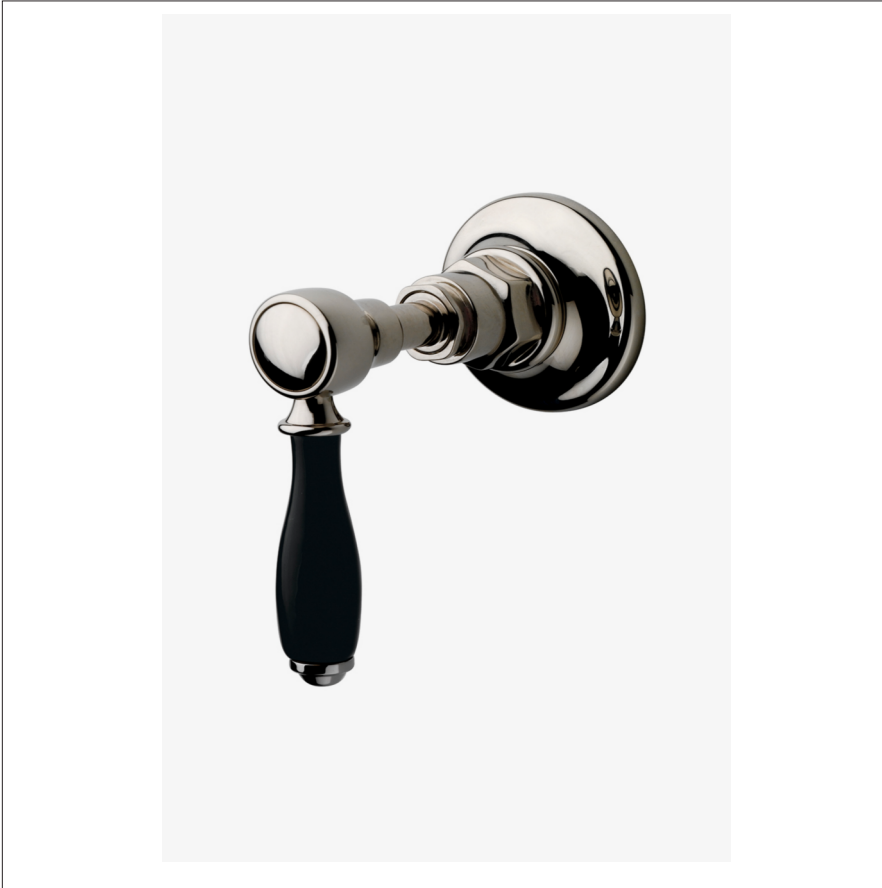
SHOWN IN EASTON VINTAGE VOLUME CONTROL VALVE TRIM WITH BLACK PORCELAIN LEVER HANDLE| EAVC71