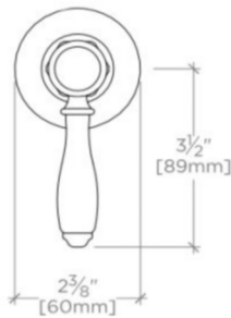
FRONT VIEW SCALE: 3"=1'-0"