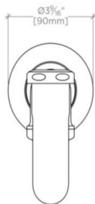
FRONT VIEW SCALE: 3"=1'-0"