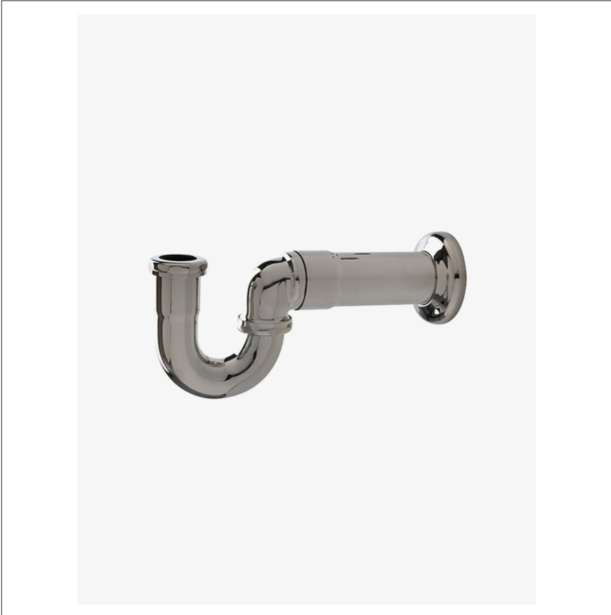
SHOWN IN UNIVERSAL BOSTON P-TRAP 1 1/2" X 1 1/4" | UNPT99