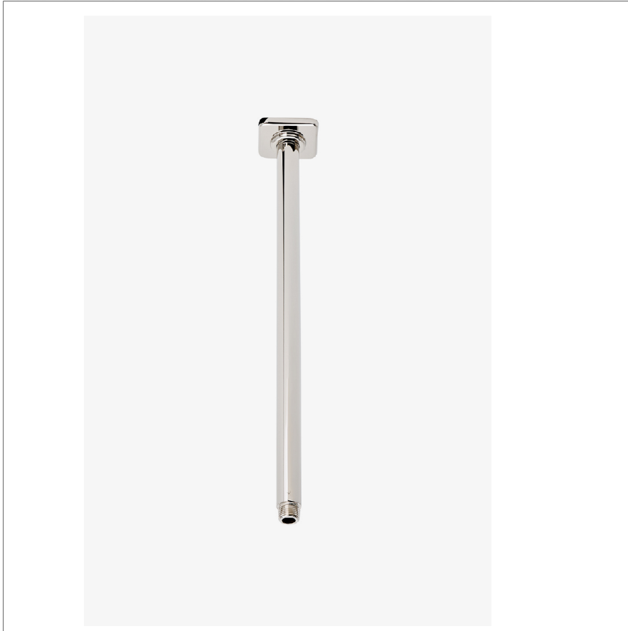
SHOWN IN LUDLOW 18" CEILING MOUNTED SHOWER ARM WITH FLANGE | LDCL18

Ludlow 18" Ceiling Mounted Shower Arm with Flange