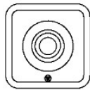
CEILING VIEW SCALE: 3"=1'-0"

Ludlow 18" Ceiling Mounted Shower Arm with Flange