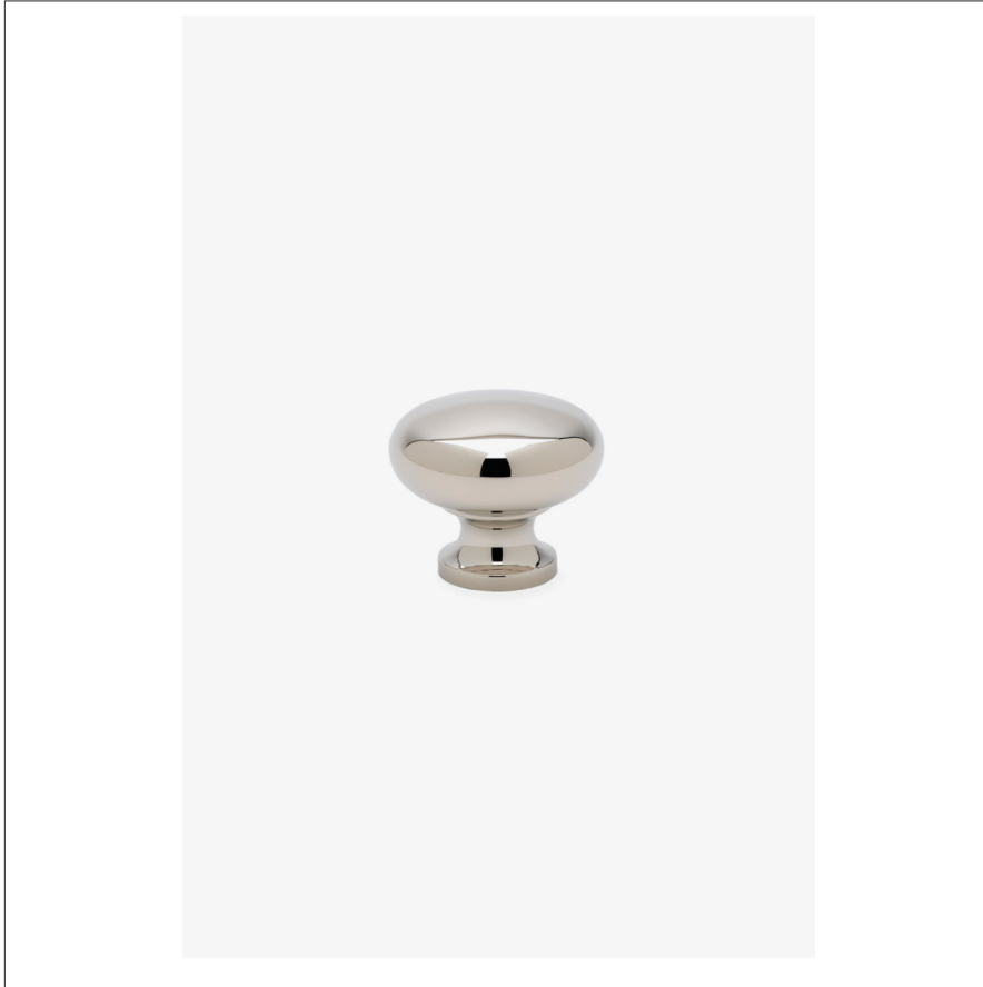
SHOWN IN UNIVERSITY 1" KNOB| UNHW11