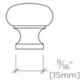
FRONT VIEW SCALE: 6"=1'-0"