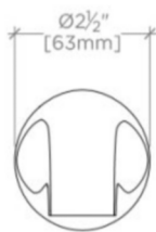
FRONT VIEW SCALE: 3"=1'-0"