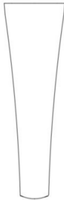
TOP VIEW SCALE: 3"=1'-0"