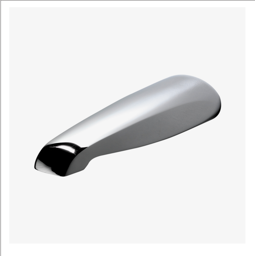
SHOWN IN UNIVERSAL WALL MOUNTED TUB SPOUT | UNTS34