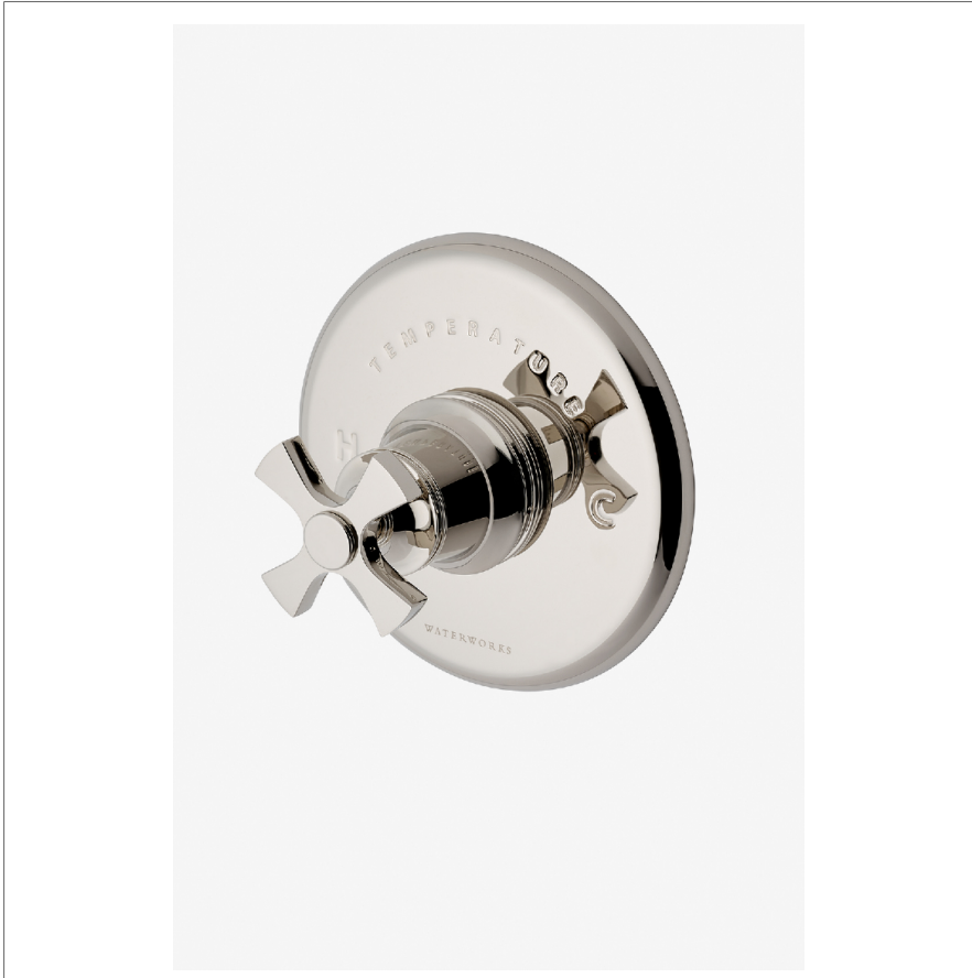
SHOWN IN TRANSIT THERMOSTATIC CONTROL VALVE TRIM WITH CROSS HANDLE | TRTH01

Transit Thermostatic Control Valve Trim with Cross Handle