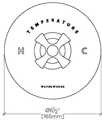
FRONT VIEW SCALE: 3"=1'-0"