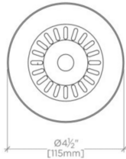
TOP VIEW SCALE: 3"=1'-0"