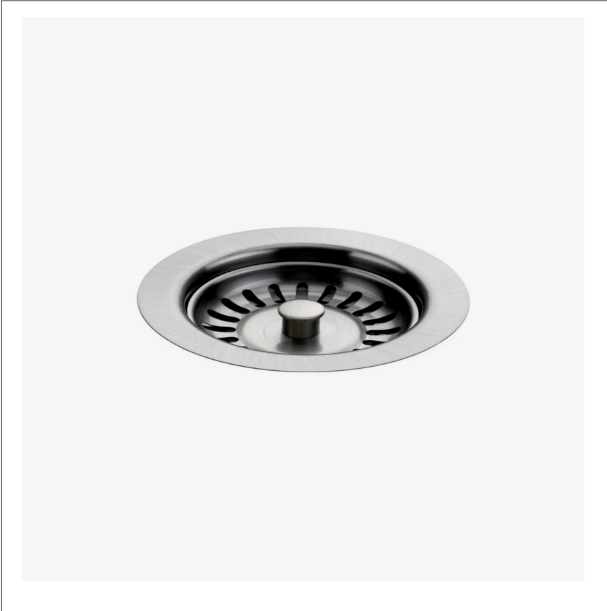
SHOWN IN UNIVERSAL KITCHEN SINK STRAINER 3 1/2" | UNKS30