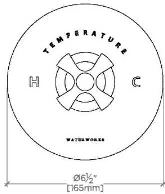
FRONT VIEW SCALE: 3"=1'-0"