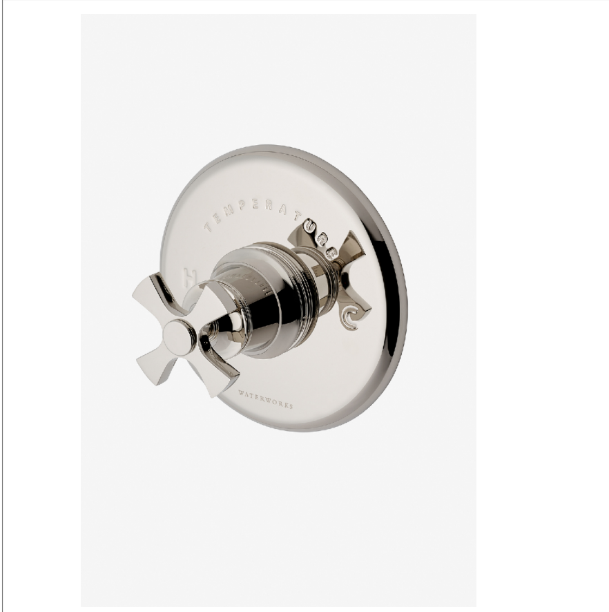
SHOWN IN TRANSIT THERMOSTATIC CONTROL VALVE TRIM WITH CROSS HANDLE | TRTH01

Transit Thermostatic Control Valve Trim with Cross Handle