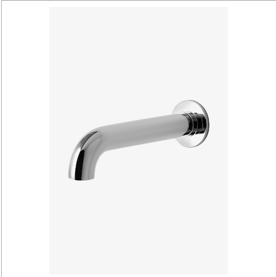
SHOWN IN FLYTE WALL MOUNTED TUB SPOUT | FLTS80