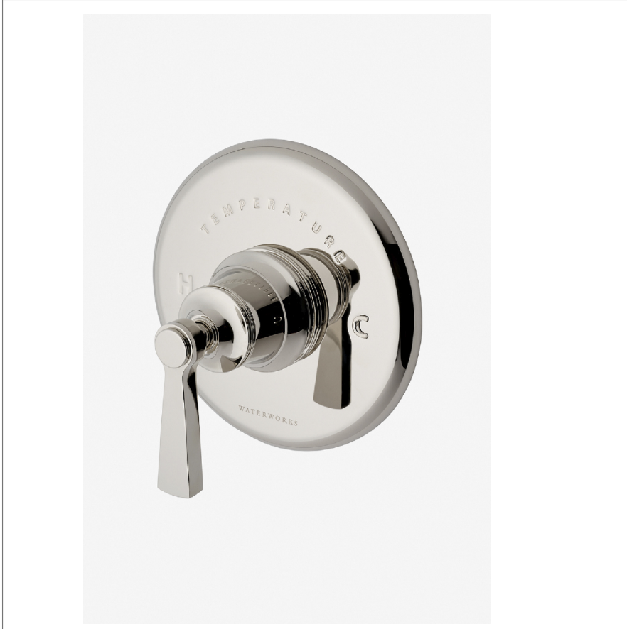
SHOWN IN TRANSIT THERMOSTATIC CONTROL VALVE TRIM WITH LEVER HANDLE | TRTH10

Transit Thermostatic Control Valve Trim with Lever Handle