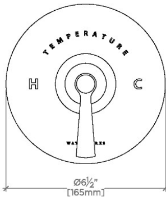
FRONT VIEW SCALE: 3"=1'-0"