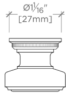
TOP VIEW SCALE: 6"=1'-0"