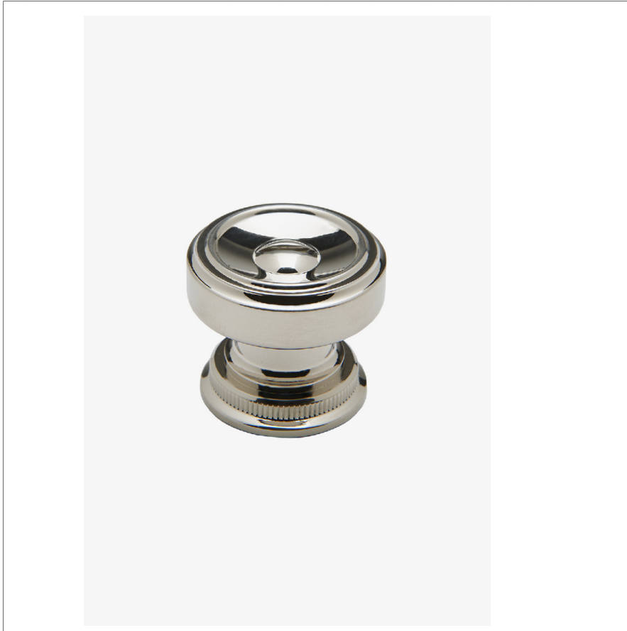
SHOWN IN R.W. ATLAS 1 1/4" ROSETTE KNOB | RWHW10