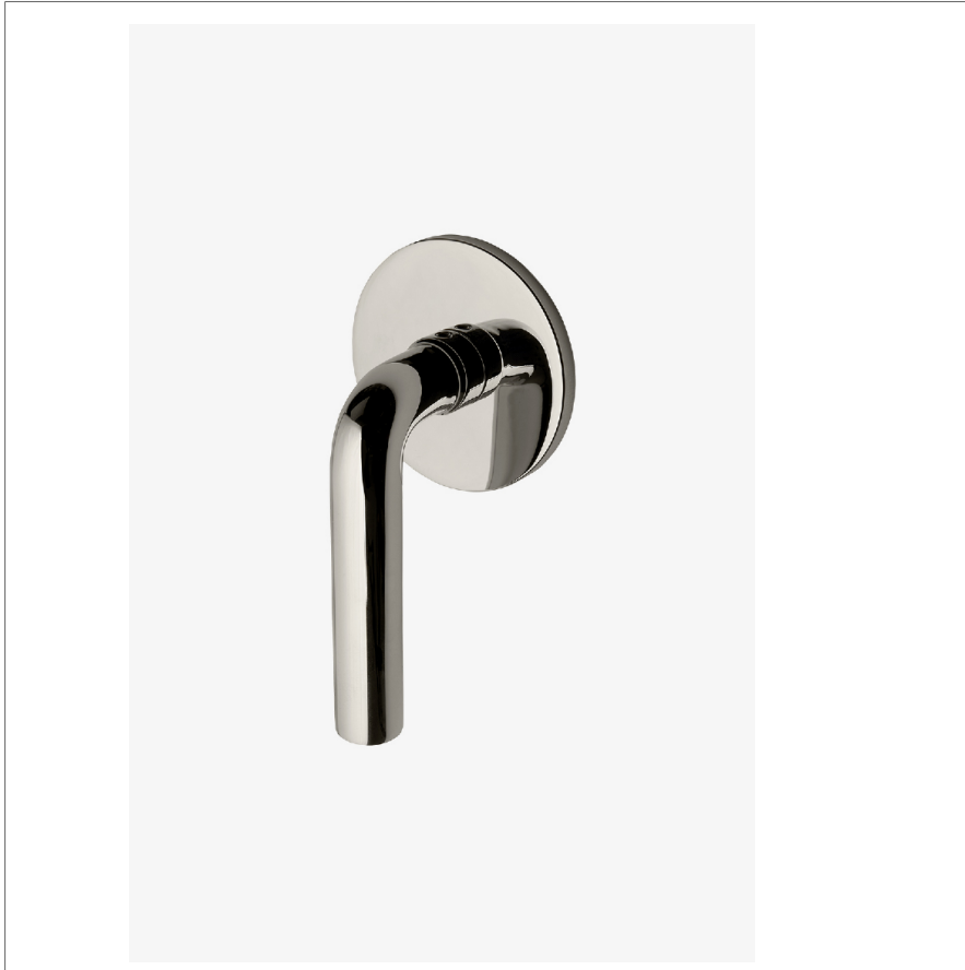
SHOWN IN FLYTE VOLUME CONTROL WITH LEVER HANDLE | FLVC50