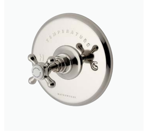
Thermostatic Control Valve Trim with Cross Handle* STYLE: HGTH01