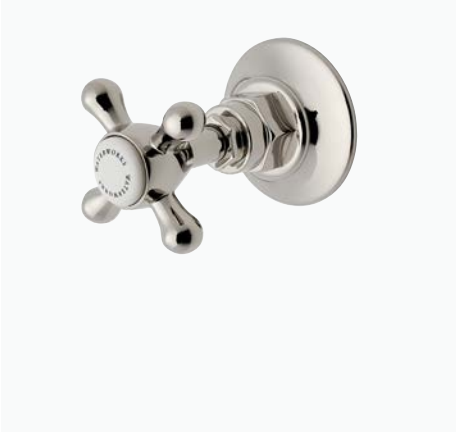
Volume Control Valve Trim with Cross Handle* STYLE: HGVC40