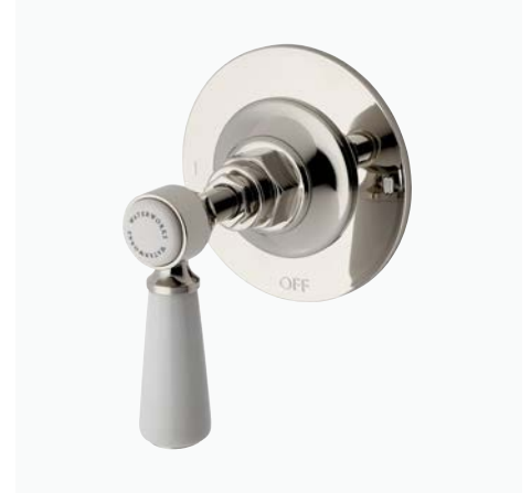
Two Way Diverter Valve Trim for Thermostatic with Roman Numerals and Porcelain Lever Handle* STYLE: HG2T10