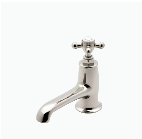
One Hole Lavatory Faucet with Cross Handle