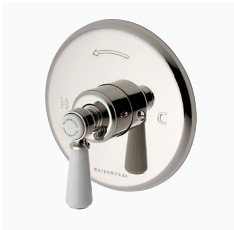
Pressure Balance Control Valve Trim with Porcelain Lever Handle* STYLE: HGPB10