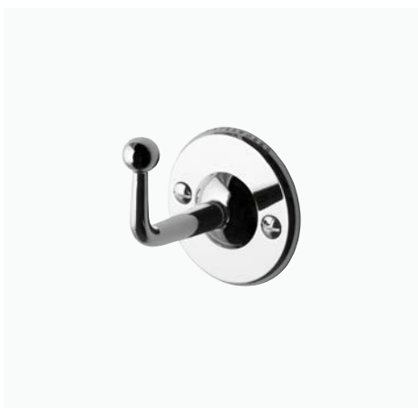
Single Hook STYLE: HGRH35