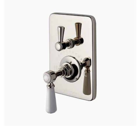
Integrated Thermostatic and Diverter Trim with Porcelain Lever Handle* STYLE: HGTH32