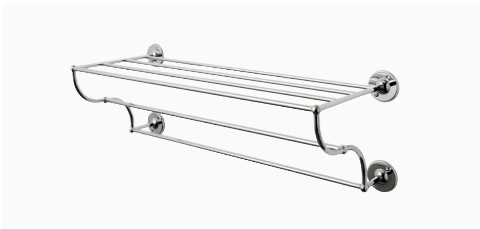
Hotel Rack STYLE: HGHR77