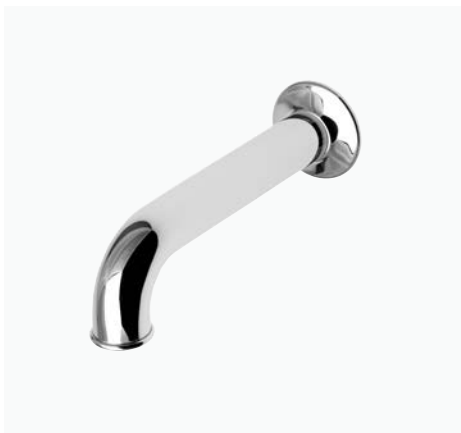
Wall Mounted Tub Spout STYLE: HGTS81