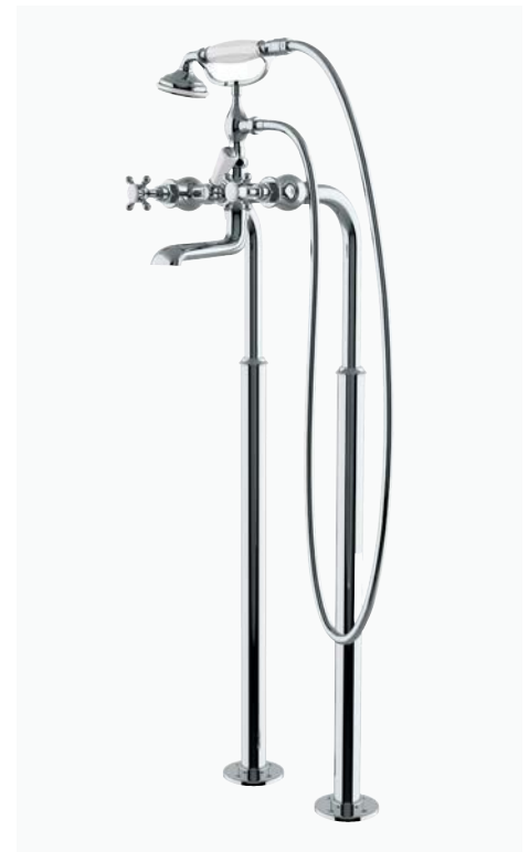
Floor Mounted Exposed Tub Filler with Handshower and Cross Handles† STYLE: HGXT60