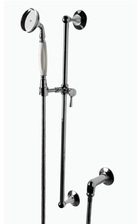
Handshower on Bar STYLE: HGHS10