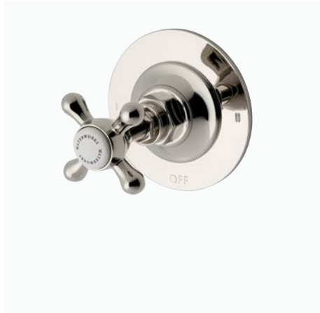
Two Way Diverter Valve Trim for Thermostatic with Roman Numerals and Cross Handle* STYLE: HG2T01