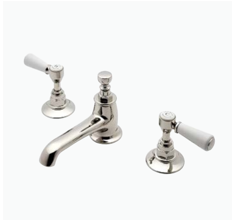
Lavatory Faucet with Porcelain Lever Handles