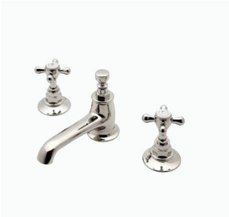
Lavatory Faucet with Cross Handles