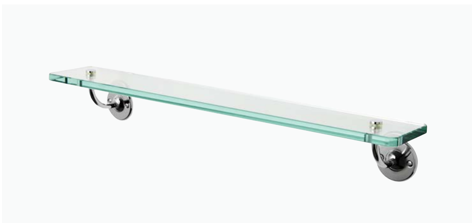
Single Tier Shelf STYLE: HGSF24