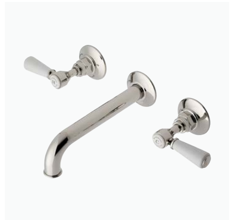
Wall Mounted Lavatory Faucet with Porcelain Lever Handles*