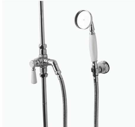
Handshower with Diverter and Porcelain Handle STYLE: HGHS30