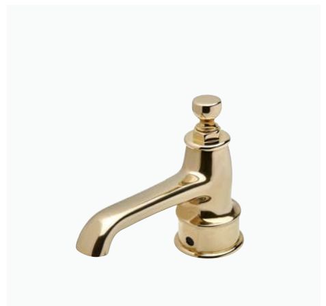
Touchless Lavatory Faucet