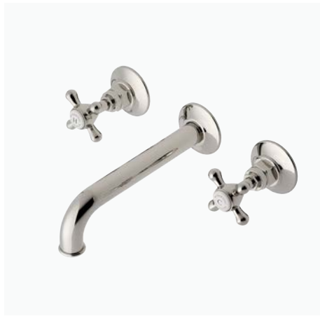
Wall Mounted Lavatory Faucet with Cross Handles*