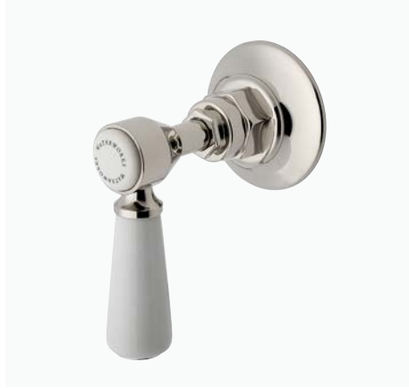
Volume Control Valve Trim with Porcelain Lever Handle* STYLE: HGVC50