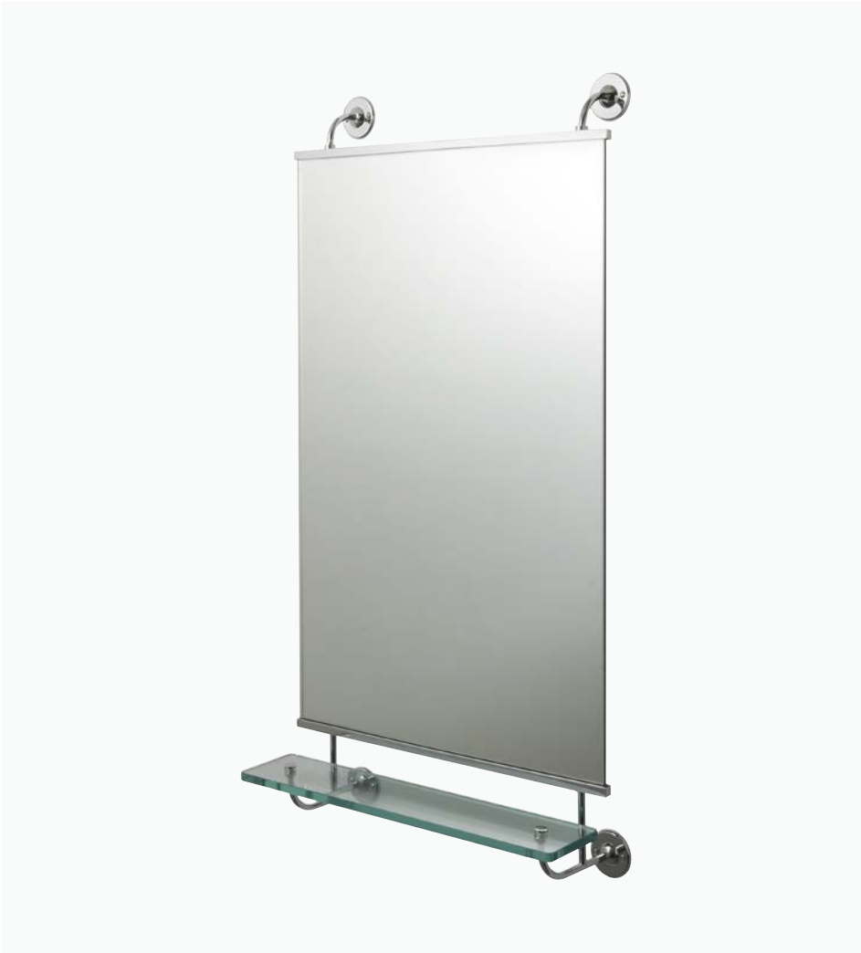
Wall Mounted Stationary Mirror 20 \frac{7}{16} " X 7 \frac{13}{16} " X 39 \frac{13}{16} " STYLE: HGMR42