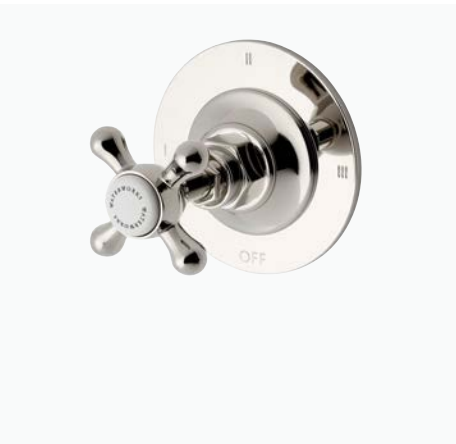
Three Way Diverter Valve Trim for Thermostatic with Roman Numerals and Cross Handle* STYLE: HG3T01