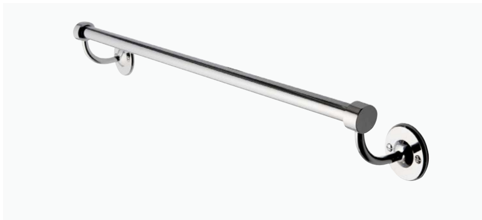
24" Single Towel Bar STYLE: HGTB24