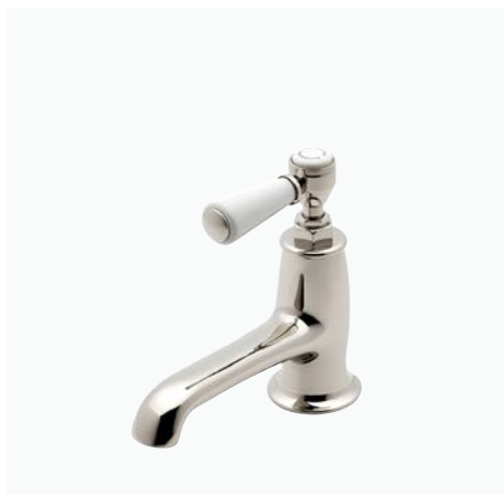
One Hole Lavatory Faucet with Porcelain Lever Handle