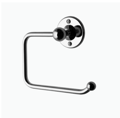
Swing Arm Paper Holder STYLE: HGPH31