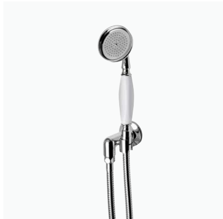
Handshower on Hook STYLE: HGHS01