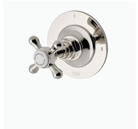
Two Way Diverter Valve Trim for Pressure Balance with Roman Numerals and Cross Handle* STYLE: HG2P01