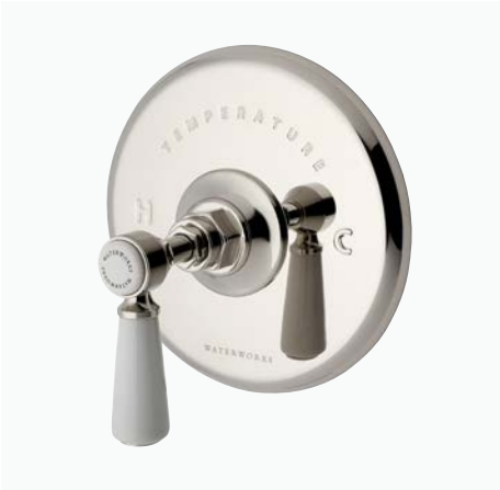
Thermostatic Control Valve Trim with Porcelain Lever Handle* STYLE: HGTH10