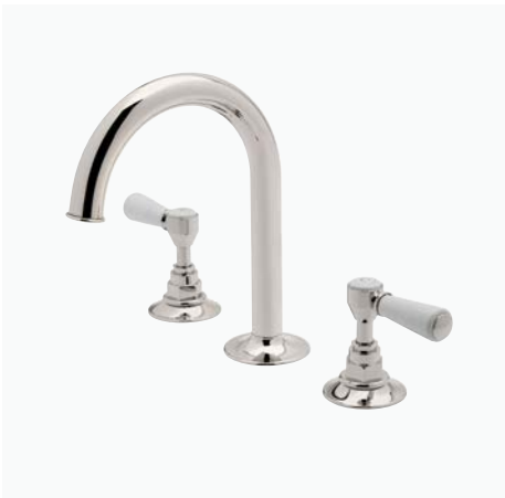
Gooseneck Lavatory Faucet with Porcelain Lever Handles