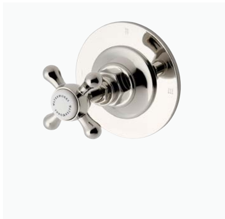
Three Way Diverter Valve Trim for Pressure Balance with Roman Numerals and Cross Handle* STYLE: HG3P01