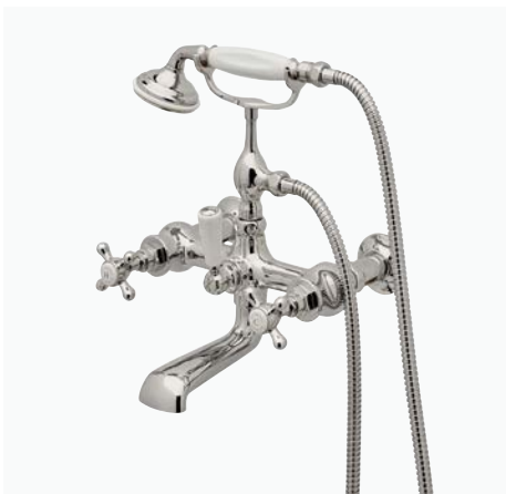
Wall Mounted Exposed Tub Filler with Handshower and Cross Handles† STYLE: HGXT20 (US) / HG20XT (UK)