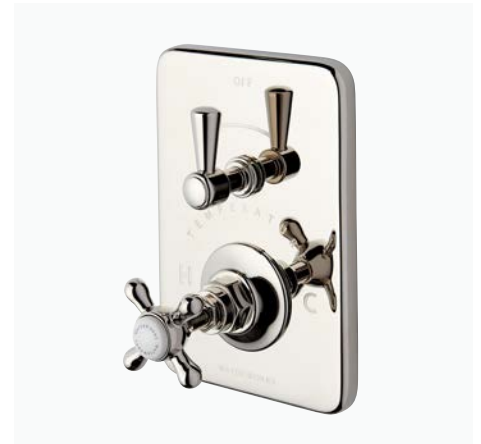
Integrated Thermostatic and Volume Control Trim with Cross Handle* STYLE: HGTH21