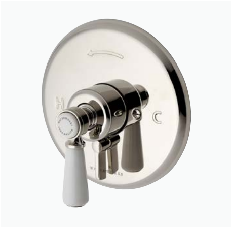
Pressure Balance with Diverter Trim with Porcelain Lever Handle* STYLE: HGPB30