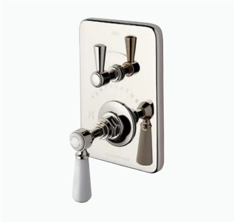
Integrated Thermostatic and Volume Control Trim with Porcelain Lever Handle* STYLE: HGTH31