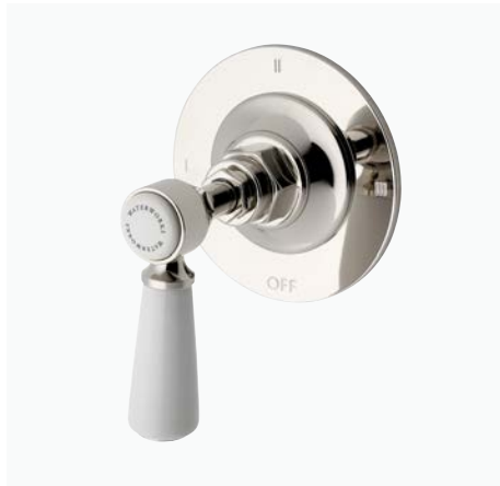
Three Way Diverter Valve Trim for Thermostatic with Roman Numerals and Porcelain Lever Handle* STYLE: HG3T10