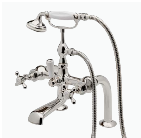
Deck Mounted Exposed Tub Filler with Handshower and Cross Handles† STYLE: HGXT40 (US) / HG40XT (UK)