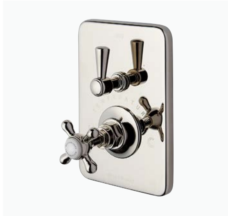
Integrated Thermostatic and Diverter Trim with Cross Handle* STYLE: HGTH22