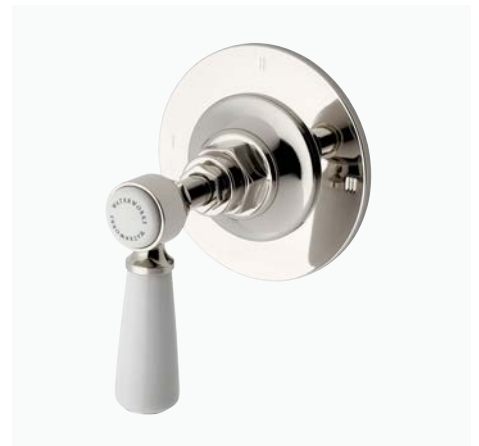
Three Way Diverter Valve Trim for Pressure Balance with Roman Numerals and Porcelain Lever Handle* STYLE: HG3P10