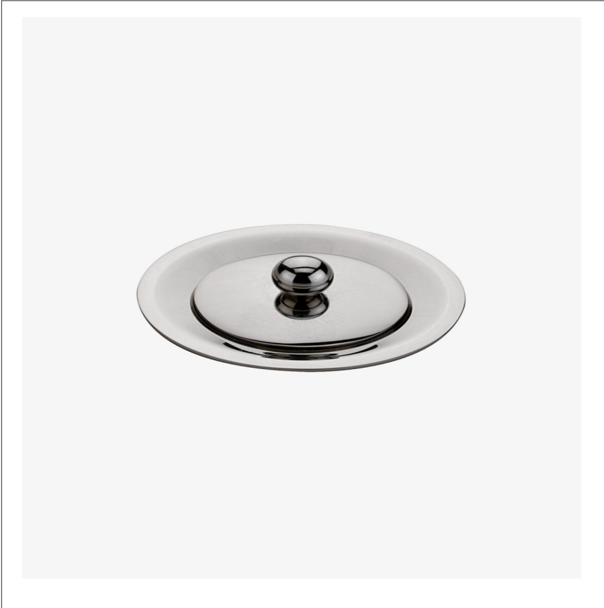
SHOWN IN UNIVERSAL EURO STYLE LIFT AND TURN LAVATORY DRAIN WITHOUT OVERFLOW| UNLD01

Universal Euro Style Lift and Turn Lavatory Drain with Overflow