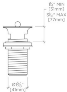
SIDE VIEW SCALE: 3"=1'-0"