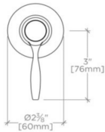
FRONT VIEW SCALE: 3"=1'-0"