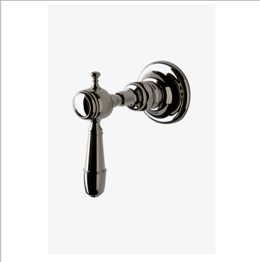
SHOWN IN JULIA VOLUME CONTROL VALVE TRIM WITH METAL LEVER HANDLE | JUVC50