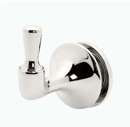
Single Sided Glass Mounted Hook STYLE: RRRHG1