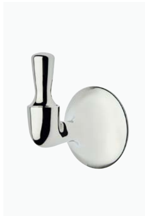
Wall Mounted Robe Hook STYLE: RRRH01