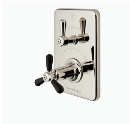
Integrated Thermostatic and Volume Control Trim with Two-Tone Tri-Spoke Handle* STYLE: RRTH20