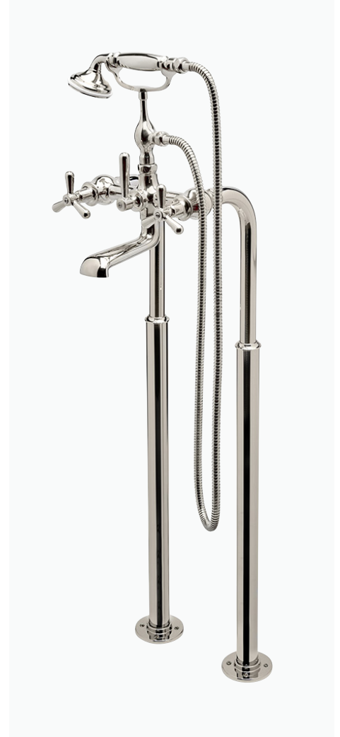
Floor Mounted Exposed Tub Filler with Handshower and Tri-Spoke Handles † STYLE: RRXT61