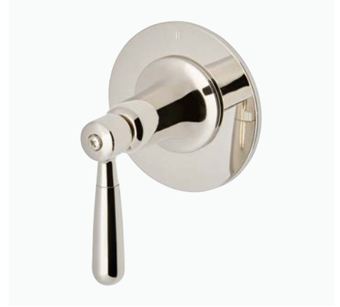
Three Way Diverter Valve Trim for Pressure Balance with Roman Numerals and Lever Handle* STYLE: RR3P11