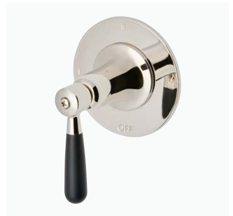
Three Way Diverter Trim for Thermostatic with Roman Numerals and Two-Tone Lever Handle* STYLE: RR3T10