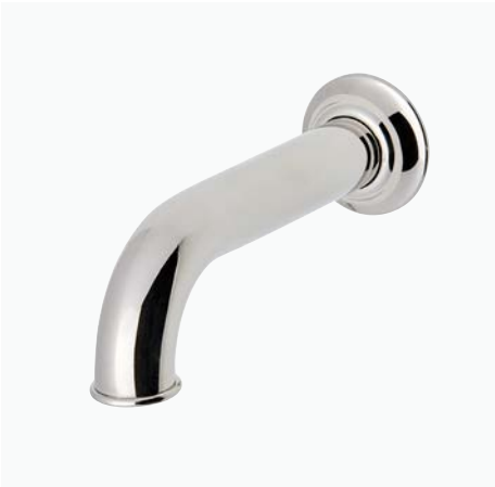
Wall Mounted Tub Spout STYLE: RRTS01