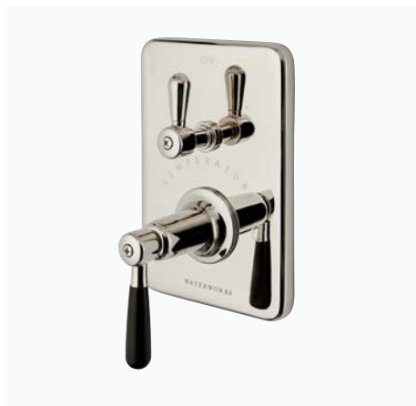
Integrated Thermostatic and Diverter Trim with Two-Tone Lever Handle* STYLE: RRTH32