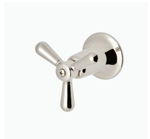
Tri-Spoke Volume Control Handle* STYLE: RRVCO2