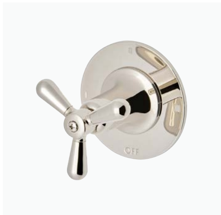
Three Way Diverter Trim for Thermostatic with Roman Numerals and Tri-Spoke Handle* STYLE: RR3T02