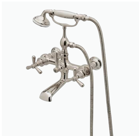
Wall Mounted Exposed Tub Filler with Handshower and Tri-Spoke Handles* STYLE: RRXT21 (US) / RR21XT (UK)