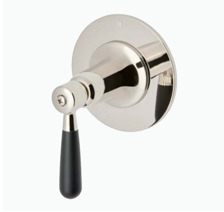
Three Way Diverter Valve Trim for Pressure Balance with Roman Numerals and Two-Tone Lever Handle* STYLE: RR3P10