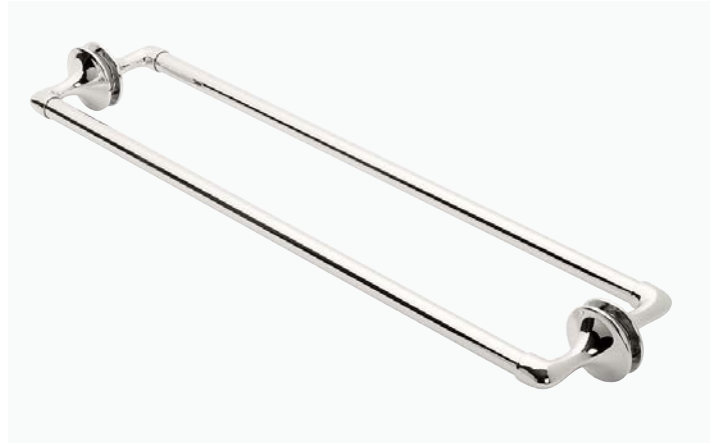
24" Double Sided Glass Mounted Towel Bar STYLE: RR24G2