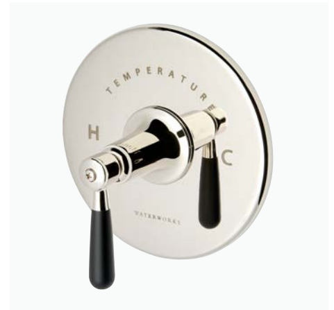
Single Thermostatic Control Valve Trim with Two-Tone Lever Handle STYLE: RRTH10