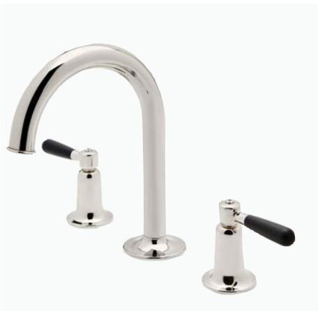
Gooseneck Lavatory Faucet with Two- Tone Lever Handles STYLE: RRLS30