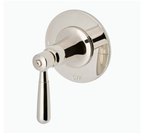
Two Way Diverter Valve Trim for Thermostatic with Roman Numerals and Lever Handle* STYLE: RR2T11