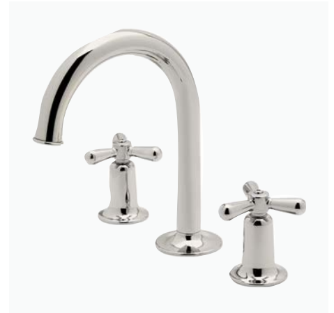
Gooseneck Lavatory Faucet with Tri-Spoke Handles STYLE: RRLS21