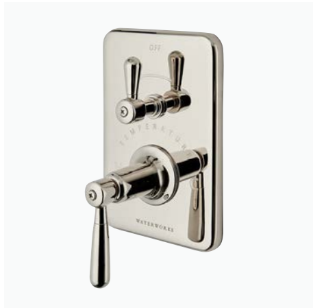
Integrated Thermostatic and Volume Control Trim with Lever Handle* STYLE: RRTH31