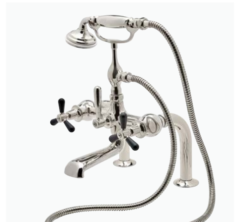
Deck Mounted Exposed Tub Filler with Handshower and Two-Tone Tri-Spoke Handles* STYLE: RRXT40 (US) / RR40XT (UK)