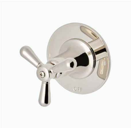
Two Way Diverter Valve Trim for Thermostatic with Roman Numerals and Tri-Spoke Handle* STYLE: RR2T02