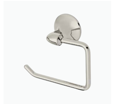
Wall Mounted Swing Arm Paper Holder STYLE: RRPH01