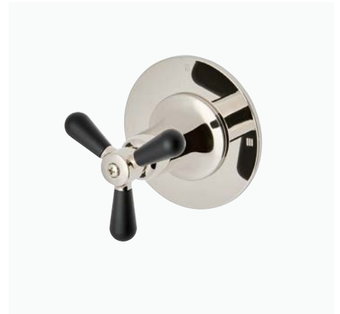
Three Way Diverter Valve Trim for Pressure Balance with Roman Numerals and Two-Tone Tri-Spoke Handle* STYLE: RR3P01