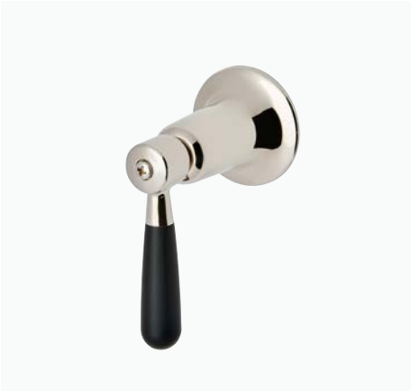
Two-Tone Lever Volume Control Handle* STYLE: RRVC10