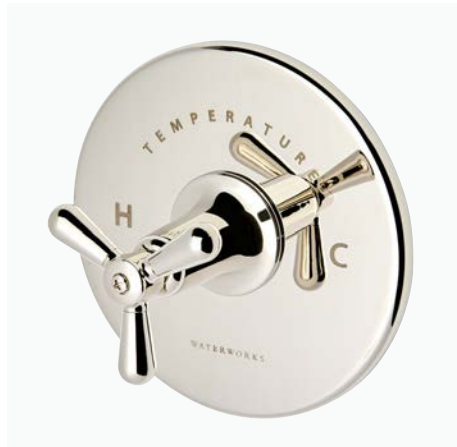
Single Thermostatic Control Valve Trim with Tri-Spoke Handle STYLE: RRTH02