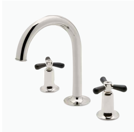
Gooseneck Lavatory Faucet with Two-Tone Tri-Spoke Handles STYLE: RRLS20