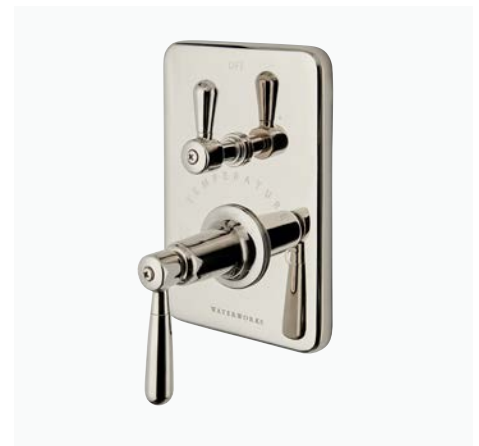
Integrated Thermostatic and Diverter Trim with Lever Handle* STYLE: RRTH33