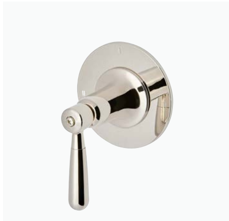
Two Way Diverter Valve Trim for Pressure Balance with Roman Numerals and Lever Handle* STYLE: RR2P11