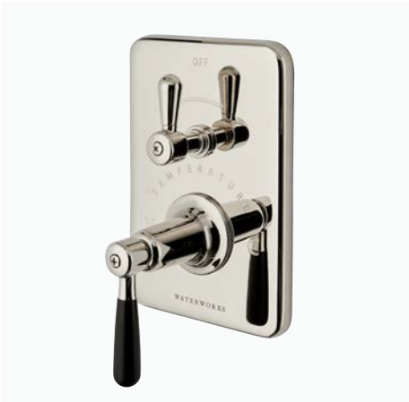
Integrated Thermostatic and Volume Control Trim with Two-Tone Lever Handle* STYLE: RRTH30