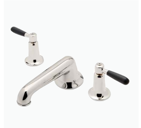
Lavatory Faucet with Two-Tone Lever Handles STYLE: RRLS10