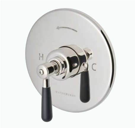
Pressure Balance Control Valve Trim with Two-Tone Lever Handle* STYLE: RRPB10