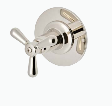
Three Way Diverter Valve Trim for Pressure Balance with Roman Numerals and Tri-Spoke Handle* STYLE: RR3P02