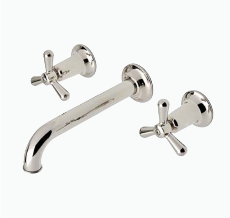
Wall Mounted Lavatory Faucet with Tri-Spoke Handles STYLE: RRLS61