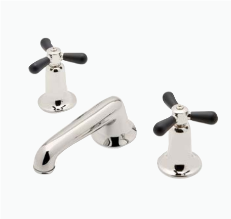
Lavatory Faucet with Two-Tone Tri-Spoke Handles STYLE: RRLS01