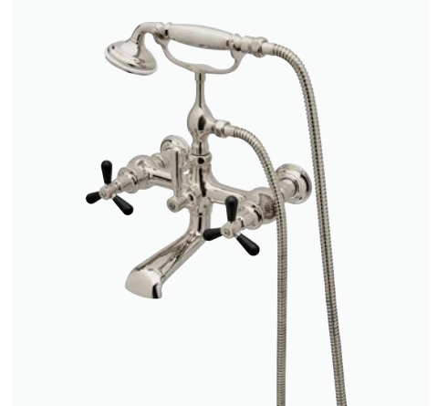
Wall Mounted Exposed Tub Filler with Handshower and Two-Tone Tri-Spoke Handles* STYLE: RRXT20 (US) / RR20XT (UK)