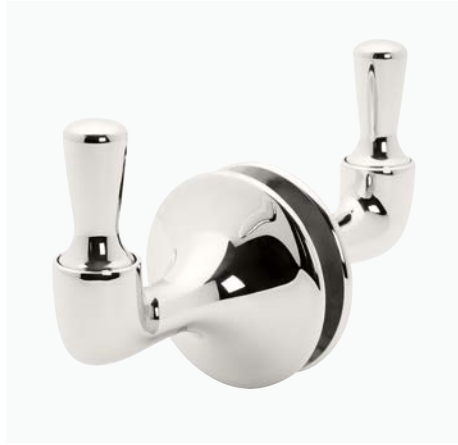
Single Double Glass Mounted Hook STYLE: RRRHG2