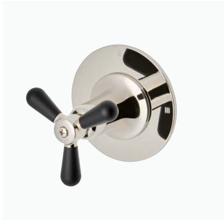
Two Way Diverter Valve Trim for Pressure Balance with Roman Numerals and Two-Tone Tri-Spoke Handle* STYLE: RR2P01