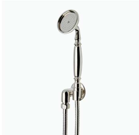
Handshower on Hook STYLE: RRHS01