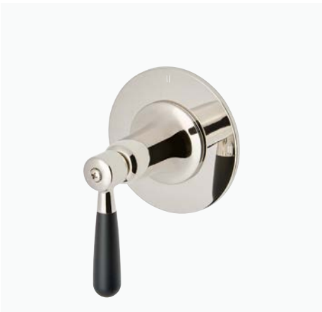
Two Way Diverter Valve Trim for Pressure Balance with Roman Numerals and Two-Tone Lever Handle* STYLE: RR2P10