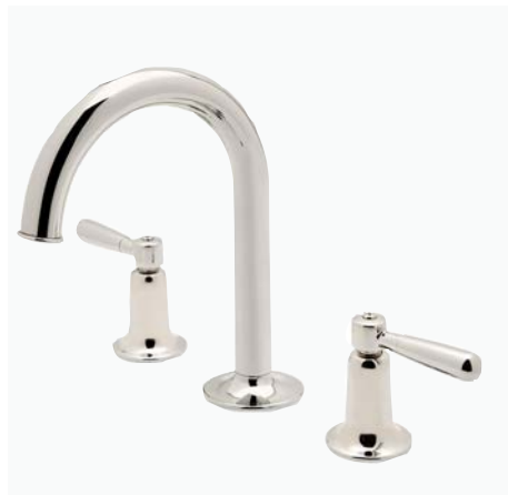
Gooseneck Lavatory Faucet with Lever Handles STYLE: RRLS31