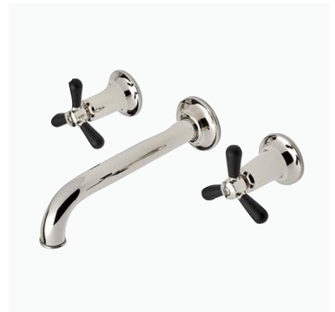
Wall Mounted Lavatory Faucet with Two-Tone Tri-Spoke Handles STYLE: RRLS60