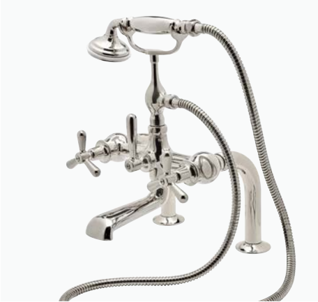
Deck Mounted Exposed Tub Filler with Handshower and Tri-Spoke Handles † STYLE: RRXT41 (US) / RR41XT (UK)