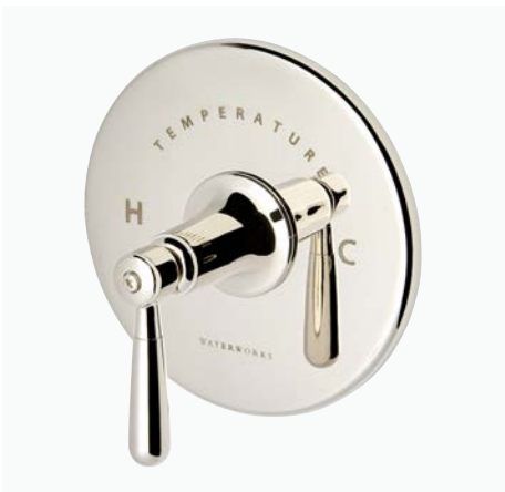
Single Thermostatic Control Valve Trim with Lever Handle STYLE: RRTH11