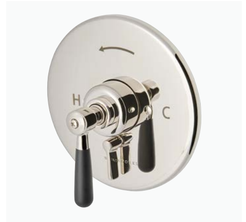
Pressure Balance with Diverter Trim with Two-Tone Lever Handle* STYLE: RRPB30