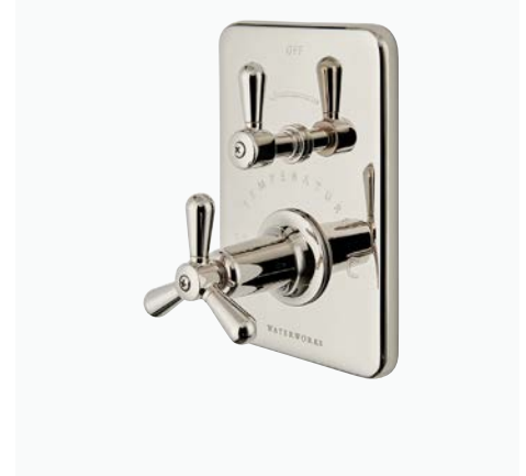
Integrated Thermostatic and Volume Control Trim with Tri-Spoke Handle* STYLE: RRTH21