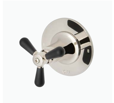
Two Way Diverter Valve Trim for Thermostatic with Roman Numerals and Two-Tone Tri-Spoke Handle* STYLE: RR2T01