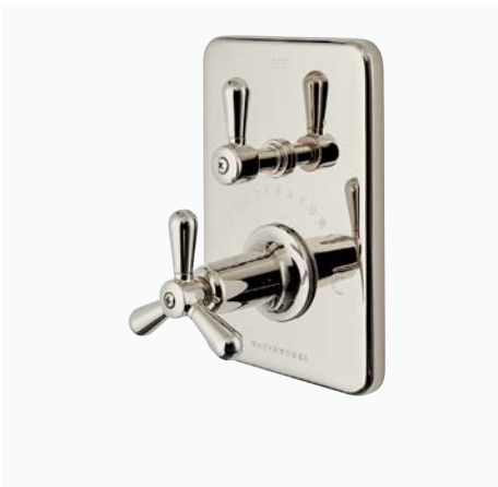
Integrated Thermostatic and Diverter Trim with Tri-Spoke Handle* STYLE: RRTH23