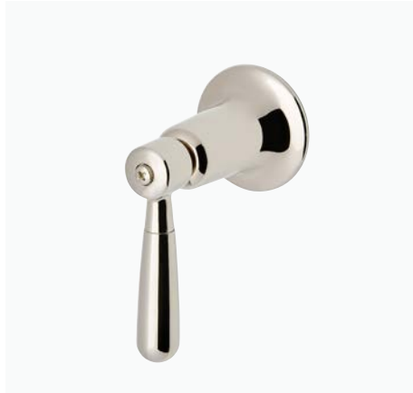
Lever Volume Control Handle* STYLE: RRVC11