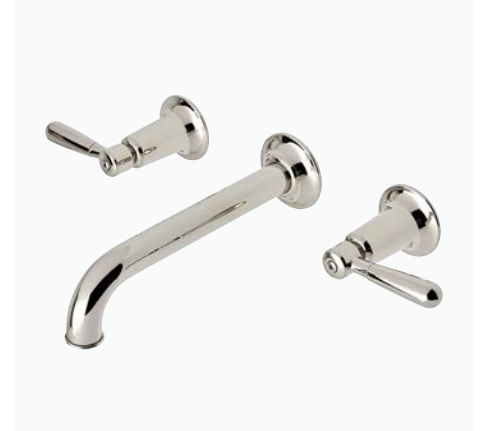
Wall Mounted Lavatory Faucet with Lever Handles STYLE: RRLS71