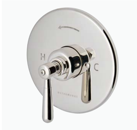
Pressure Balance Control Valve Trim with Lever Handle* STYLE: RRPB11