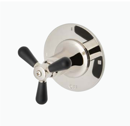
Three Way Diverter Trim for Thermostatic with Roman Numerals and Two-Tone Tri-Spoke Handle* STYLE: RR3T01