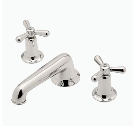
Lavatory Faucet with Tri-Spoke Handles STYLE: RRLS02