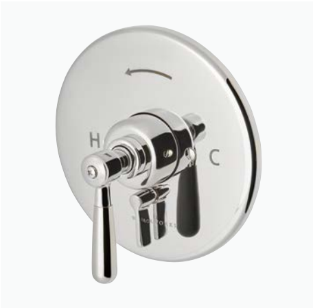
Pressure Balance with Diverter Trim with Lever Handle* STYLE: RRPB31