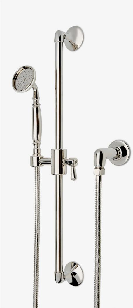
Handshower on Bar STYLE: RRHS10