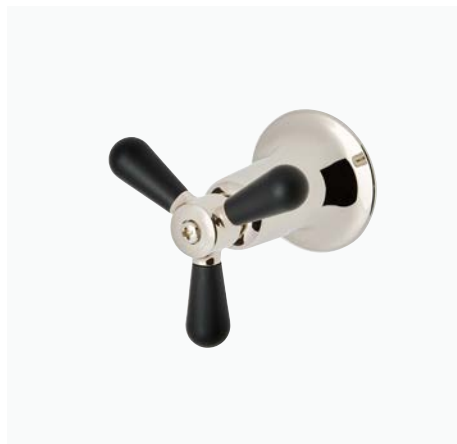
Two-Tone Tri-Spoke Volume Control Handle* STYLE: RRVCO1