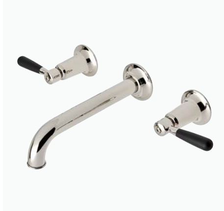
Wall Mounted Lavatory Faucet with Two-Tone Lever Handles STYLE: RRLS70