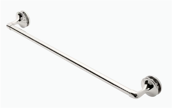
24" Single Sided Glass Mounted Towel Bar STYLE: RR24G1