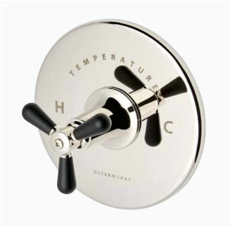
Single Thermostatic Control Valve Trim with Two-Tone Tri-Spoke Handle STYLE: RRTH01