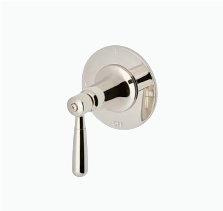
Three Way Diverter Trim for Thermostatic with Roman Numerals and Lever Handle* STYLE: RR3T11