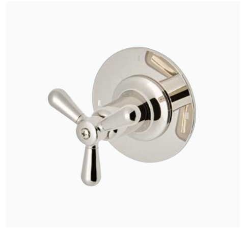
Two Way Diverter Valve Trim for Pressure Balance with Roman Numerals and Tri-Spoke Handle* STYLE: RR2P02