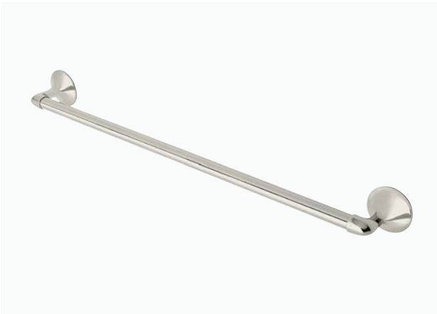
24" Single Towel Bar STYLE: RRTB24