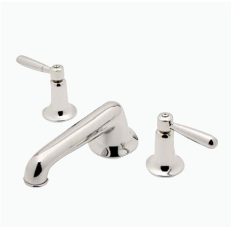
Lavatory Faucet with Lever Handles STYLE: RRLS11