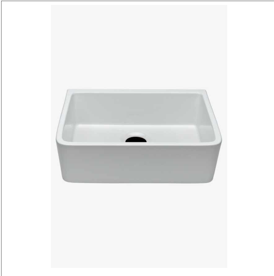
SHOWN IN CLAYBURN 23 3/8" X 18 3/4" X 8 7/8" FIRECLAY FARMHOUSE APRON KITCHEN SINK WITH REAR DRAIN| CASK50

Clayburn 23 3/8" x 18 3/4" x 8 7/8" Fireclay Farmhouse Apron Kitchen Sink with Rear Drain