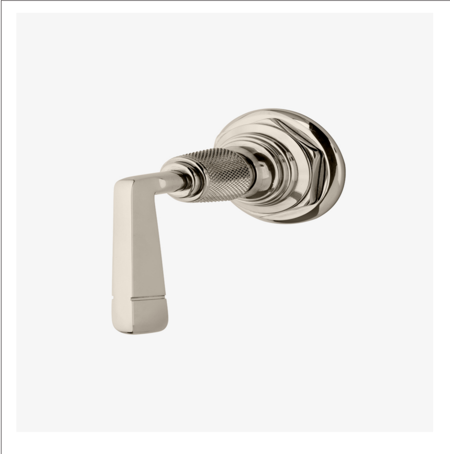
SHOWN IN R.W. ATLAS VOLUME CONTROL VALVE TRIM WITH METAL LEVER HANDLE| RWVC10