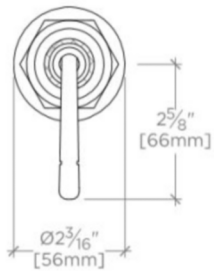
FRONT VIEW SCALE: 3"=1'-0"