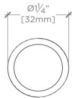
FRONT VIEW SCALE: 6"=1'-0"