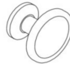
ISO VIEW SCALE: 6"=1'-0"